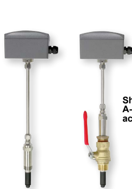
Shown with A-IEF-VLV-BR** accessory valve kit